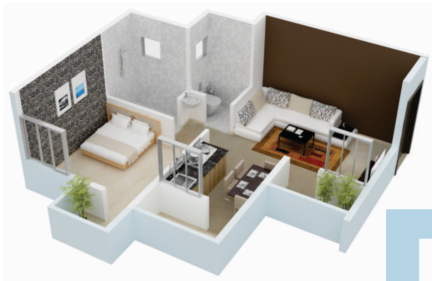
INDICATIVE VIEW SIMPLY BIG