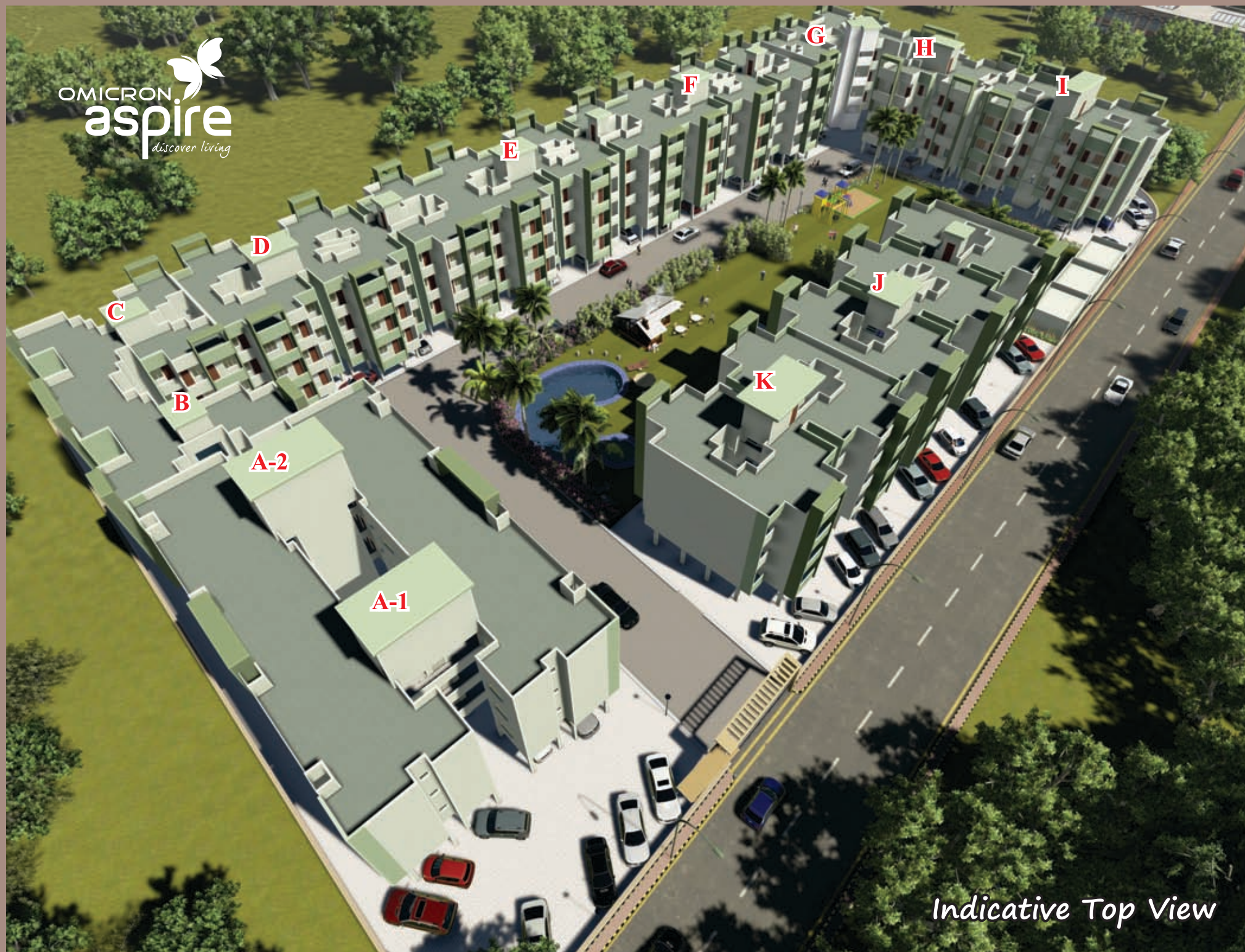
Indicative Top View